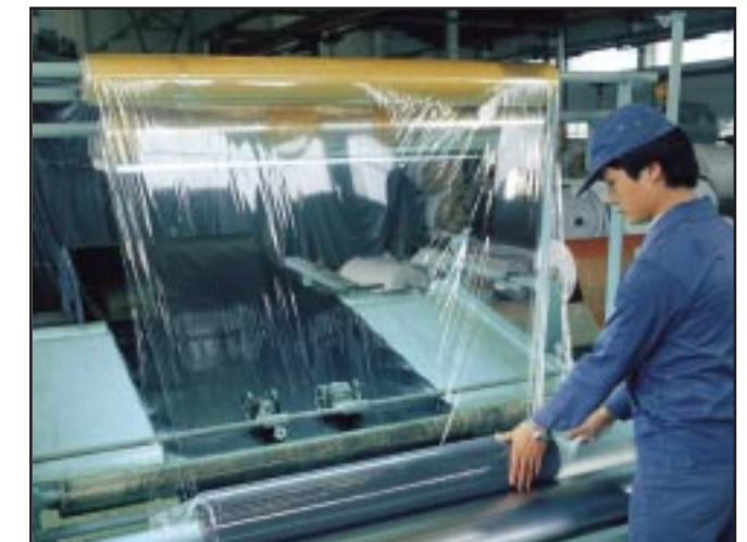
2. For the packing of roll-shape articles Items: PVC leather, wall paper, leather, glass fiber, non-woven cloths, piece goods, paper rolls and yarn rolls.