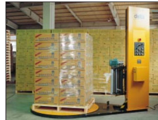
1. For pallet packing Items: Food cans, chemical products, electronic components, cement, construction materials, casing products, synthetic rubber, PVC asbestos tiles, enameled tiles, screws, cereals, or products using collective pallet packing for transporting.