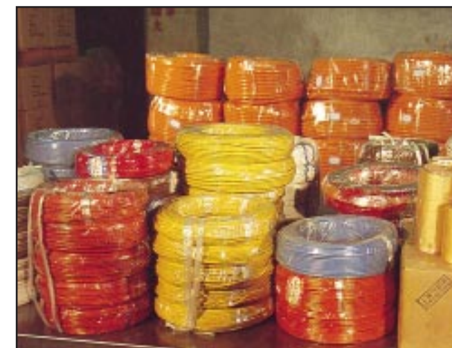
3. For packing small individual articles Items: Electric wires, iron wires, steel wires, PVC hoses, wheels, spare parts, sculptures, toilet soaps, shoes and other small articles.